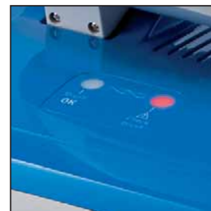
If the brush gets jammed, the vacuum turns off right away.