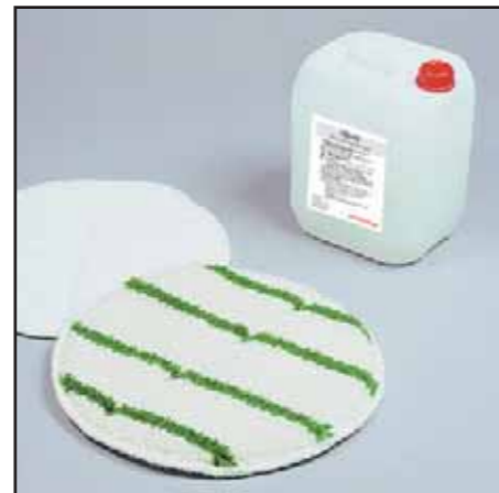
Cleaning agent Maxil, Queen Bonnet Pad and Agitator Pad